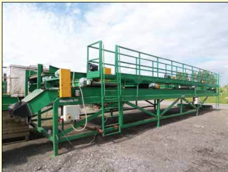
Lot No. 121