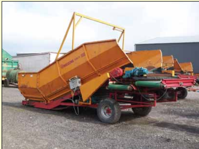
Lot No. 98