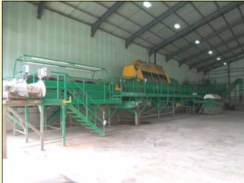
Lot No. 92